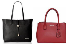
KENNETH COLE REACTION DOWLING SATCHEL