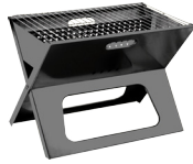
CEDAR TRAIL FOLDING GRILL