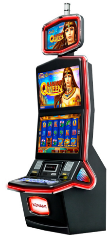
Konami's brand-new Concerto was designed to incorporate specific customer feedback and is characterized by its ability to attract and entertain casino patrons.

Consistently capturing these qualities is truly what makes KONAMI special. Is it really possible to make inorganic objects come to life and spark a special connection with the world around them? KONAMI thinks so, and based on the demand for KONAMI products, it is not alone.